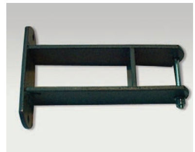
Wood mounting option