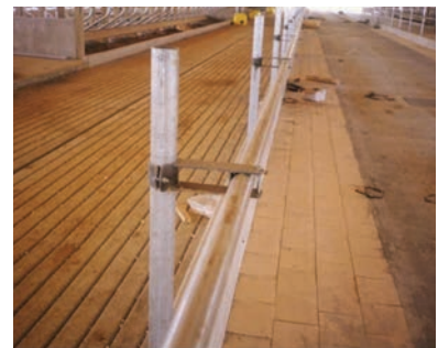
Adjustable extended pipe mount