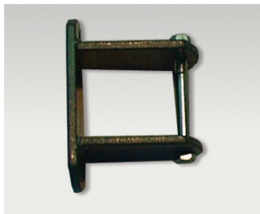
Wood mounting option