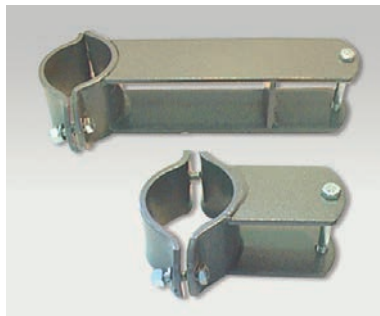
Feed rail mounting system