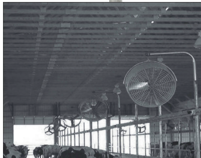
Feed line post mount

Ideal for use with mist kits or shower nozzle system.