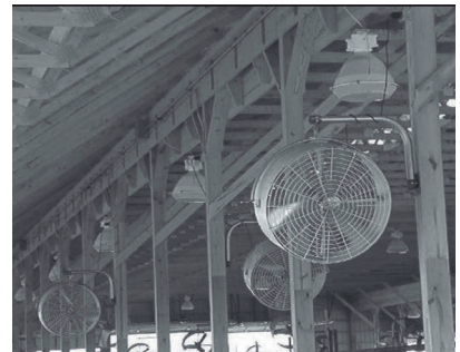
Wood or steel column