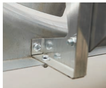
Heavy-duty bracket construction