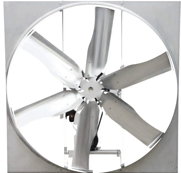
EvolutionXC 52" fan – 6-blade