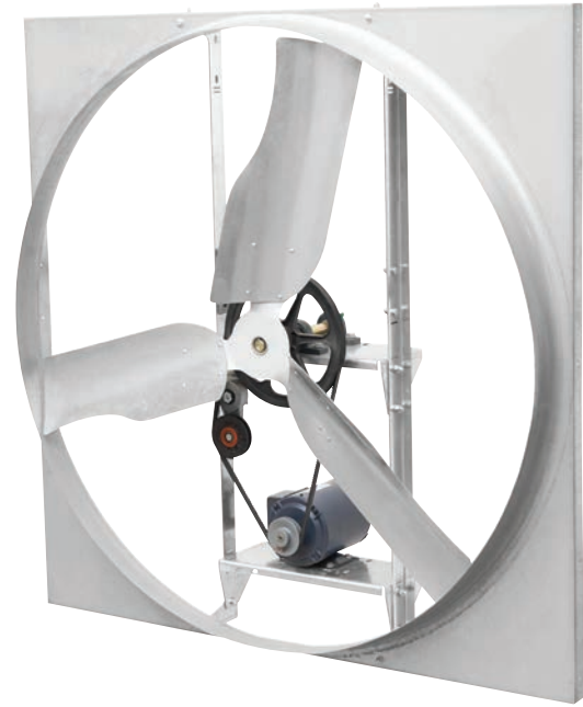
EvolutionXC 52" fan – 3-blade

1 or 1.5hp; single-phase or three-phase options.