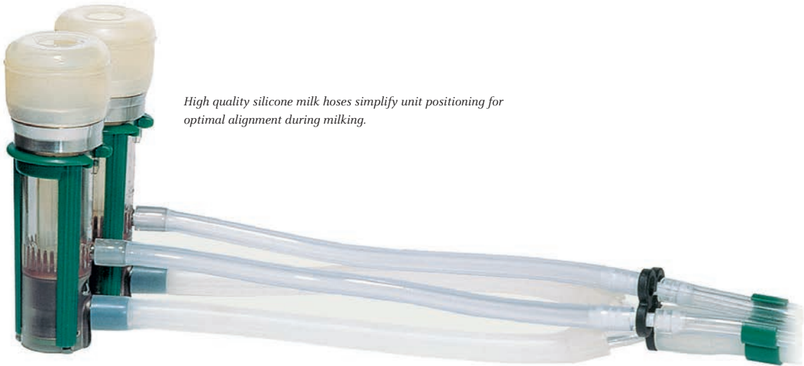
High quality silicone milk hoses simplify unit positioning for optimal alignment during milking.

The TopFlow Z and TopFlow S milking units are available just for lowline milking systems. They each easily handle high milk yields and rapid flow rates without a milk collection bowl integrated into the unit. The TopFlow was developed with the latest design elements incorporated into every feature, delivering maximum ease of use throughout the entire milking process.