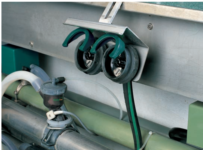
The milking unit holders are sized precisely for the TopFlow Z and TopFlow S, ensuring reliable cleaning of the teat cups during the C.I.P process. The holders integrate easily into any milking parlor for trouble-free operation.