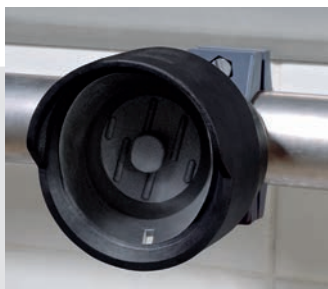
Milking unit holders ensure reliable cleaning of the teat cups during the C.I.P. process.

Innovative milk collection piece — is light-weight and easy to use. Its distinctive design is the latest in sheep and goat milking technology — optimally transferring milk while maintaining udder health.