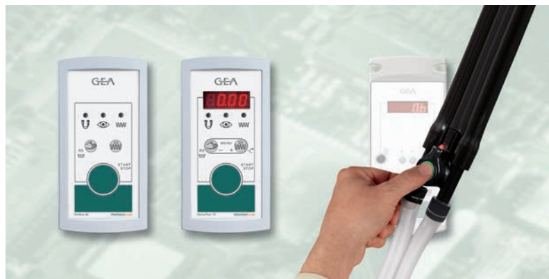
DeMax and DemaTron 60/70 and remote control